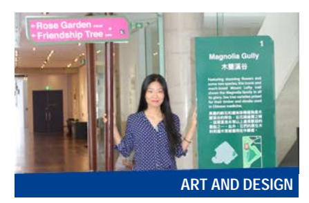
Student design solutions well received by industry more