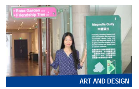
Student design solutions well received by industry more