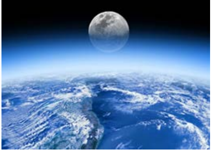
View of the the Earth and the Moon from space.