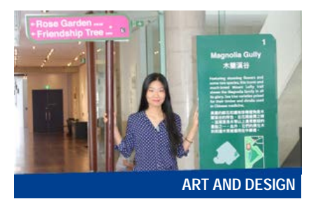
Student design solutions well received by industry more