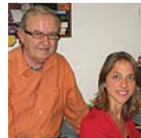
When the heat's on electricity supplies