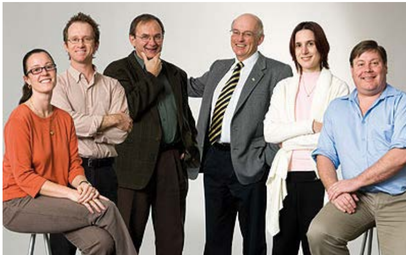
Research depth rewarded Full Story