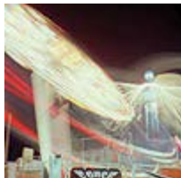
Samstag is exhibition ready