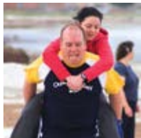
Group activity beats working out on your own