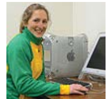
Lyndell nets nifty scholarship