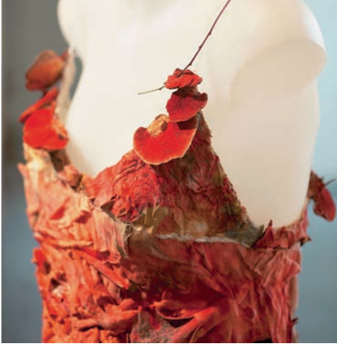
Donna FRANKLIN, Fibre Reactive , 2004–2008, orange bracket fungi