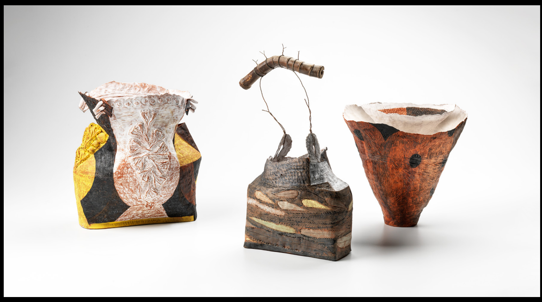
Image: Helen Fuller, Pots, 2021.