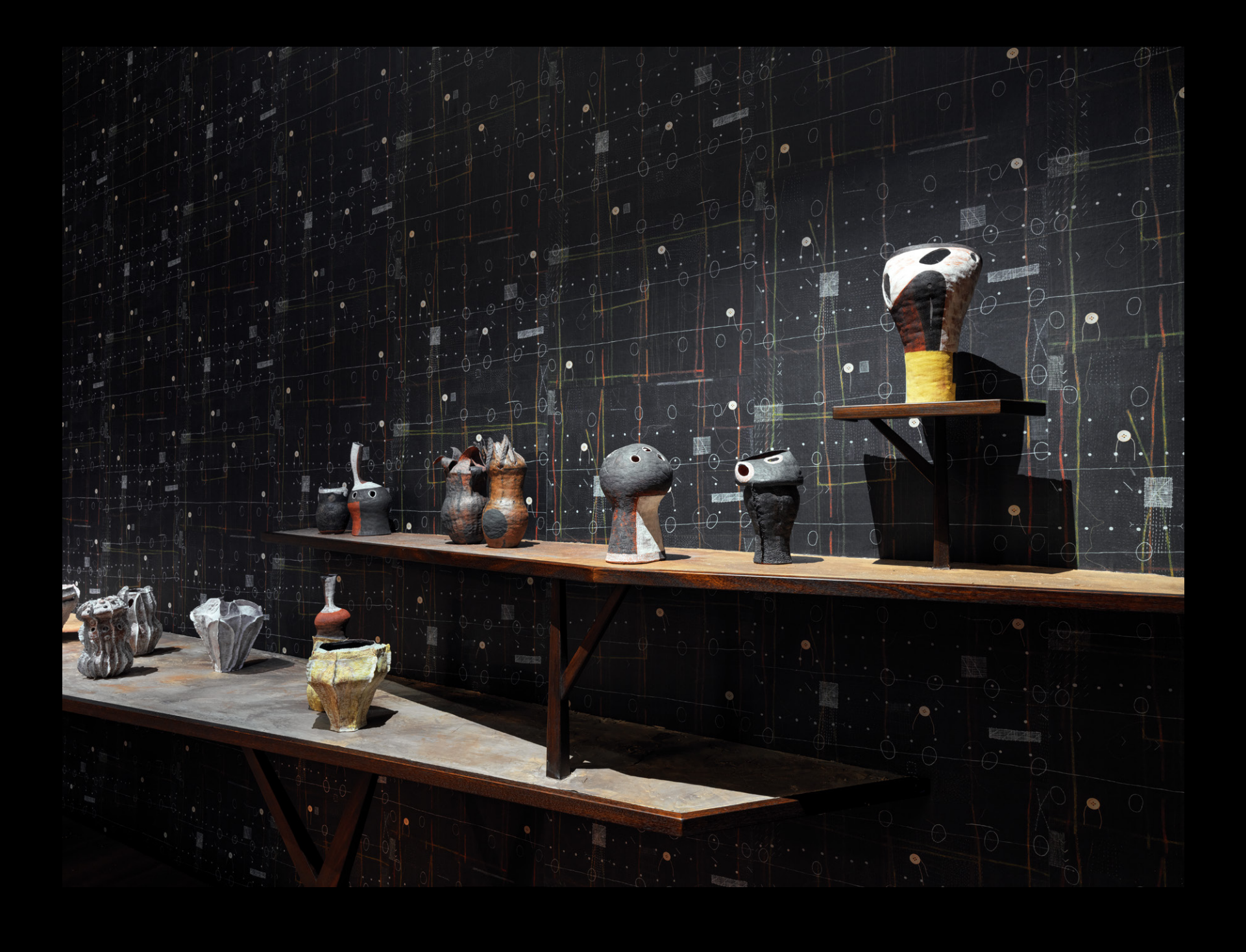
Image: Installation view, Helen Fuller, Pots, 2021. Samstag Museum of Art for the 2022 Adelaide Festival.