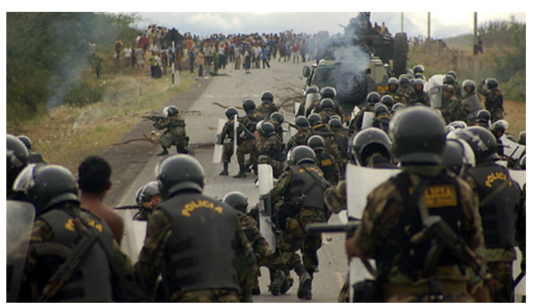
Photo 1: President Alan Garcia, 17 July 2009; photo by TV Cultura Photo 2: Police and protesters in Bagua Province 5 June 2009; photo by Thomas Quirynen/Reuters

https://creativecommons.org/licenses/by-nc-sa/2.0/