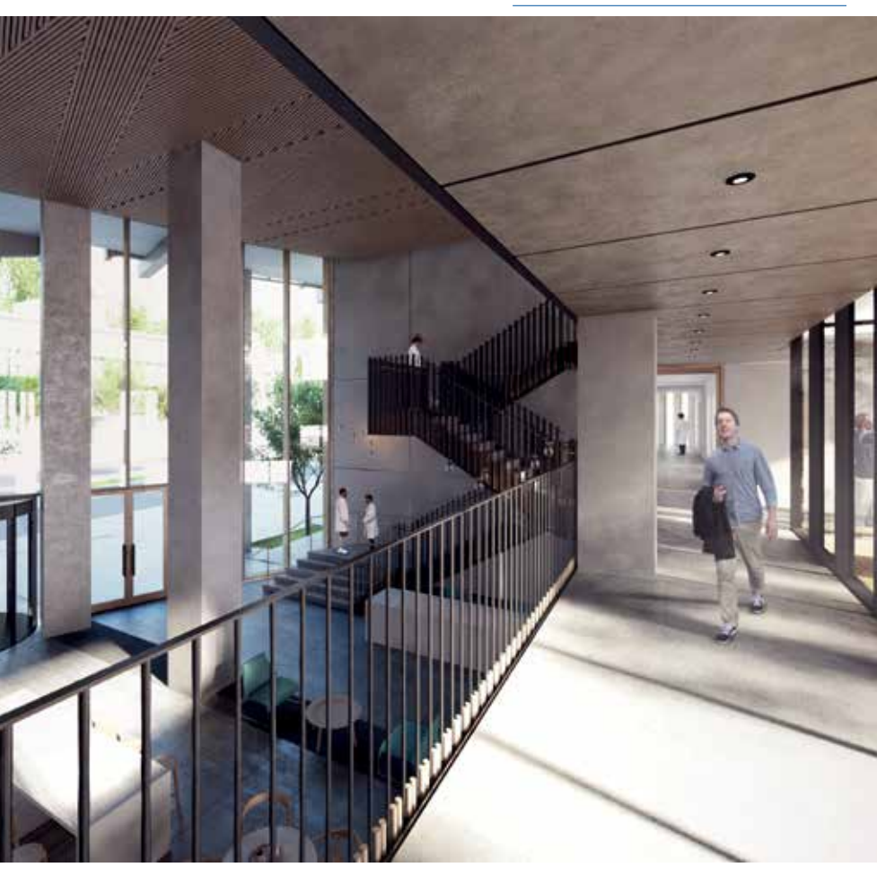
Natural light streams into level eight through an outdoor atrium