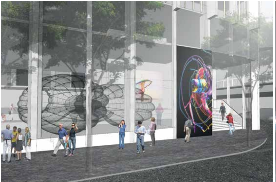
Street gallery and bridge access to Morphett Street