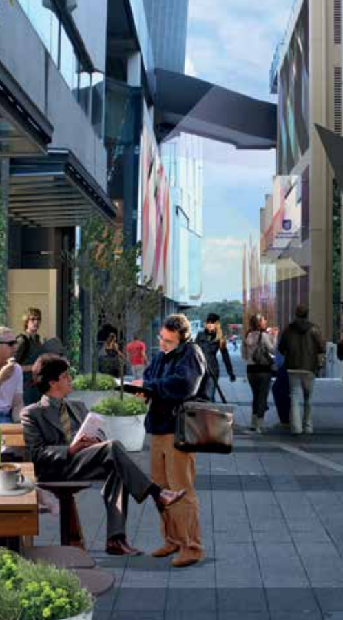
Lion Arts courtyard