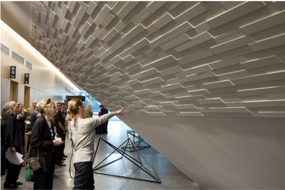
(Image: Onlookers searching for names on Pridham Hall's Inverted Pyramid)

The gym has also provided 1,100 supervised placement hours for Health Sciences students.