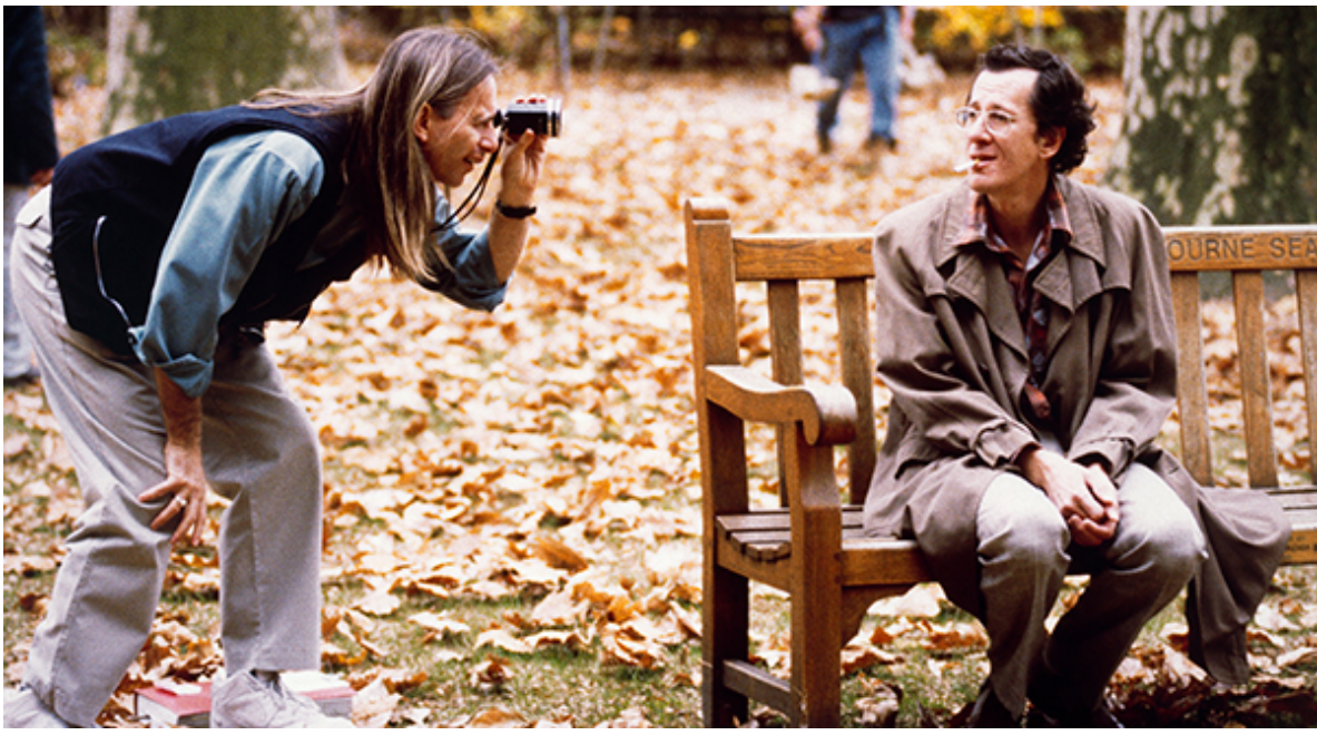
Image: Director Scott Hicks lines up a shot on actor Geoffrey Rush through his viewfinder, Shine, 1996

Bachelor of Communication Studies (Literary Studies, Art)