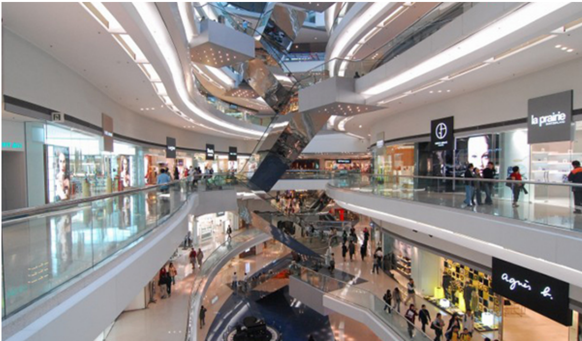
Image: The US$2.3bn Hong Kong-based shopping mall, Festival Walk, acquired by Mapletree