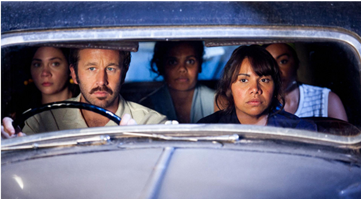
Image: Shari Sebbens as Kay, Chris O'Dowd as Dave Lovelace, Miranda Tapsell as Cynthia, Deborah Mailman as Gail and Jessica Mauboy as Julie, The Sapphires, 2012

This still was taken early on in the Shine shoot, and was my first day on set taking stills for a feature film. [Director] Scott Hicks was lining up his view-finder on [lead actor] Geoffrey Rush, deciding which lens to use. The entire time the crew were there setting up equipment and cameras around Geoffrey and he just stayed in character, seemingly oblivious to any distraction. This photograph shows a truly trusting relationship between this director and actor.