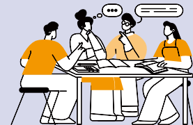
Collaborative study with Japanese students

The relationship between Japan and other countries, Japan's history, religion, and legal system