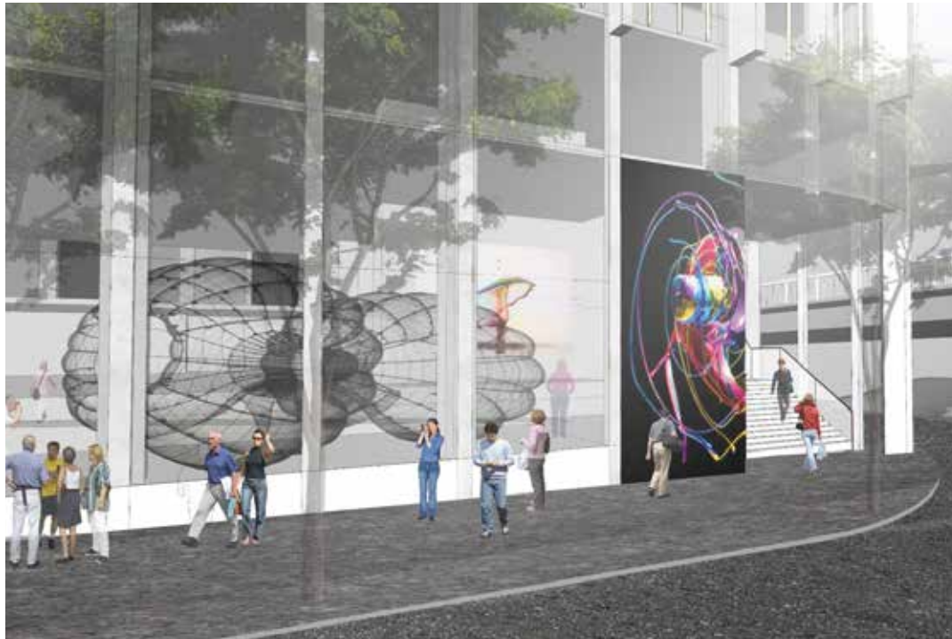
Street gallery and bridge access to Morphett Street

The ICT Innovation and Collaboration Centre is a strategic venture between UniSA, HP and the South Australian Government. The centre will provide a unique environment for staff and students of the University, South Australian business, industry organisations and HP to engage, collaborate and explore new ideas for ICT business and products.