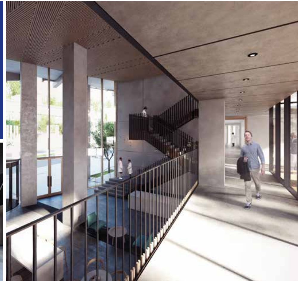
A bridge will stretch across the first floor mezzanine enabling easy access between spaces on the building's lower levels