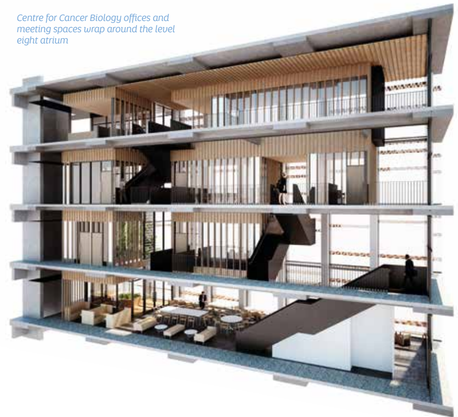
Centre for Cancer Biology offices and meeting spaces wrap around the level eight atrium

The University of South of Australia is paving the way for the future of research into blood-related cancers, giving the Centre for Cancer Biology a new home in the Health Innovation Building. The building will bring together some of Australia's top researchers with world-class research facilities including labs to work with tissue cultures, cell sorting and flow cytometry spaces, a DNA Library Preparation suite and more.