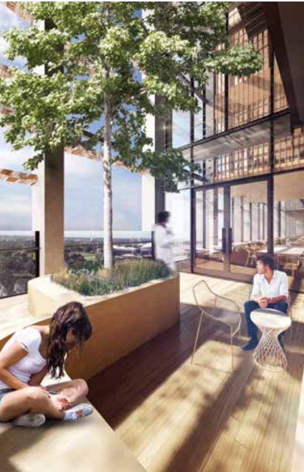
Natural light streams into level eight through an outdoor atrium

Cost: $230m Size: 14 floors, 29,000m 2 Design: Swanbury Penglas Architects and BVN Architects in association Delivery: 2018