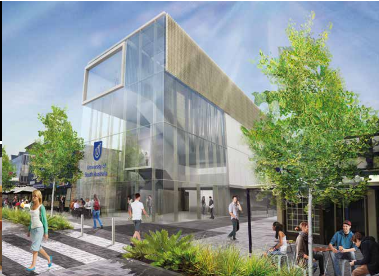
Artist's impression of future expansion to the new Student Lounge looking south across Hindley Street (image courtesy of Hassell Architects)