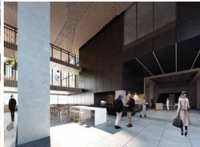
The first-floor foyer will provide the ideal space to meet with stakeholders and collaborators