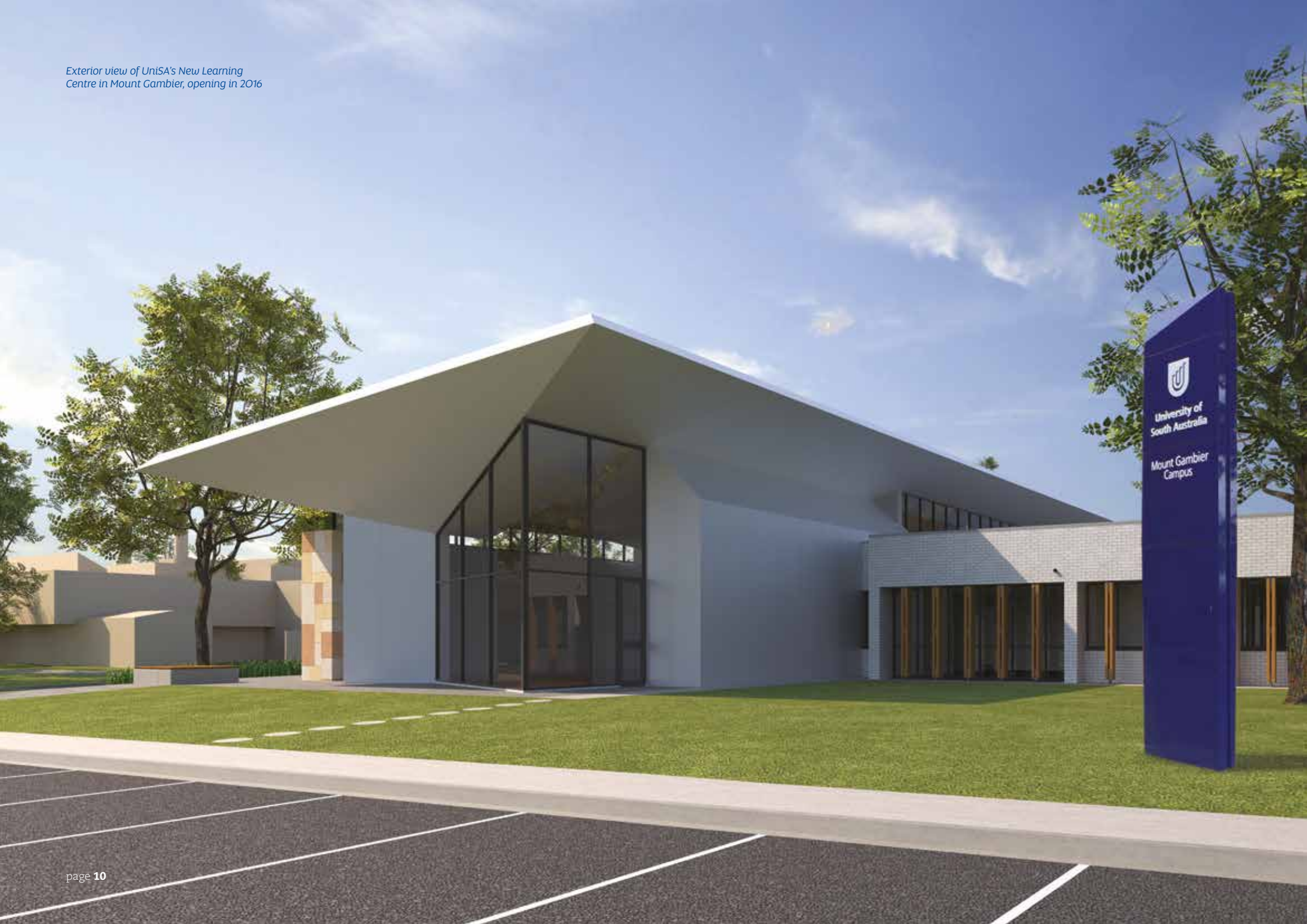
Exterior view of UniSA's New Learning Centre in Mount Gambier, opening in 2016