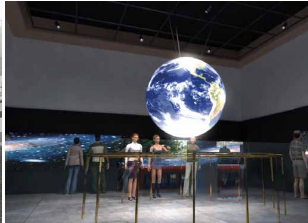
Planet gallery: part of the Sci|C|Ed studio

Our new Science|Creativity|Education Studio (Sci|C|Ed) will bring science and technology out of the lab and into the public realm, creating new opportunities for scientists, students and industry to innovate, create and collaborate. This purpose-built facility will include exhibition spaces, galleries, studios, as well as a science café and shop.