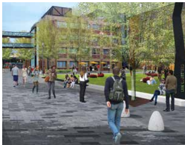
School of Law courtyard

Breathing new life into campus with gardens and greenery including tree planting, vertical gardens, raised planters and more is a key part of the plan.