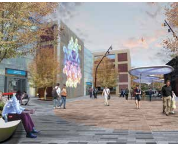
Lion Arts courtyard

Breathing new life into campus with gardens and greenery including tree planting, vertical gardens, raised planters and more is a key part of the plan.