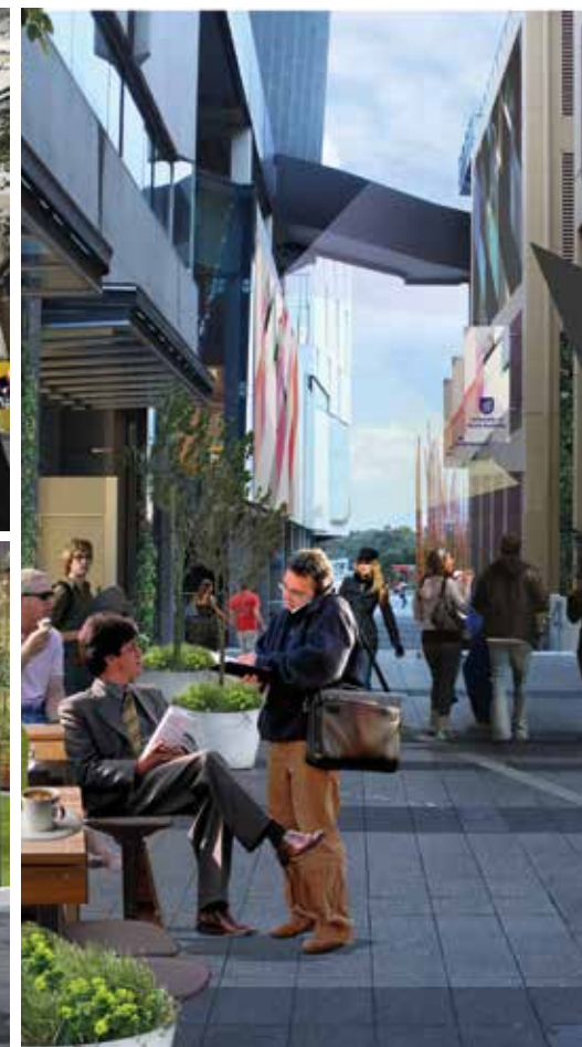
Fenn Place corridor