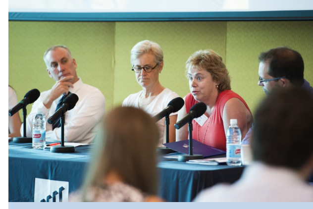
Panellists at the 7th Shared Learning in Clinical Practice Symposium discuss different views and perspectives in the mental health care of young people