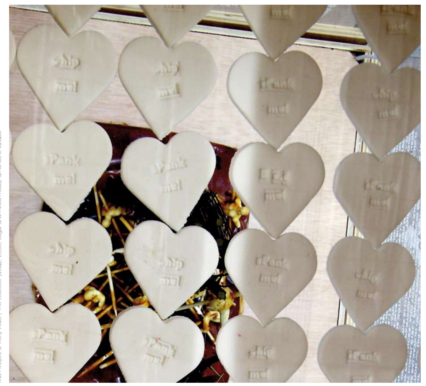
Wish Meijers & Tricky Walsh, The Collector (detail), 2006, sugar and mixed media, dimentions variable