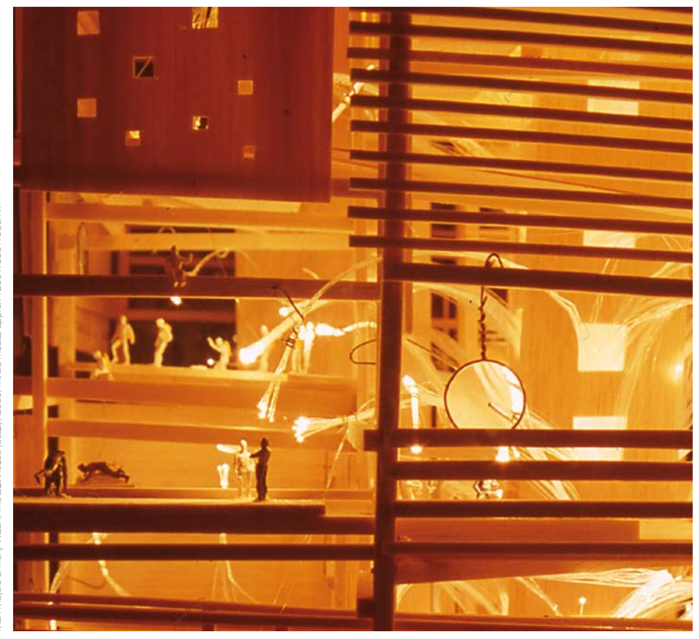
Mish Meijers & Tricky Walsh, The Bathhouse (detail), 2006, mixed media, approx 1200 x 500 x 500mm