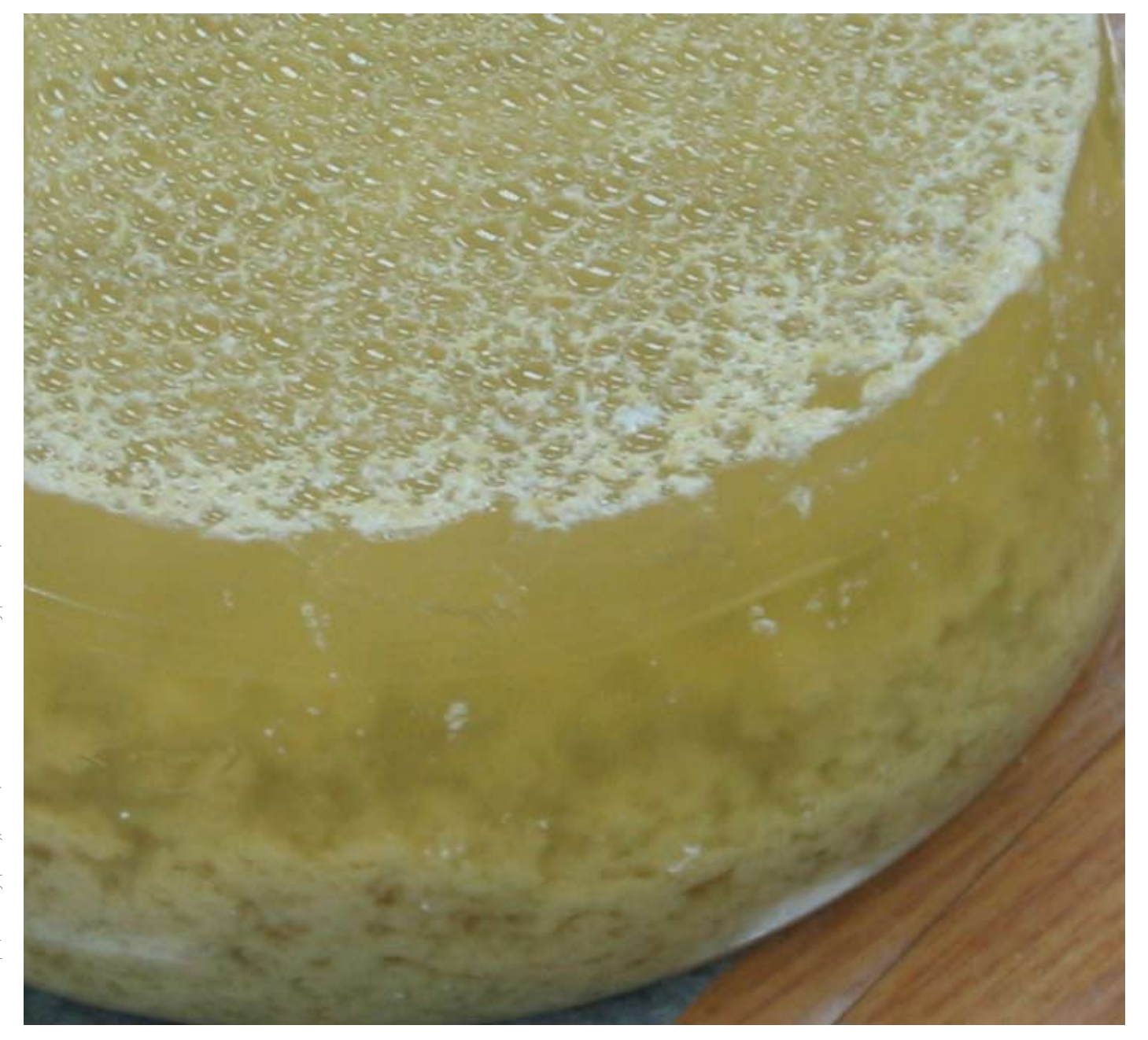
Anna Philips, Fat Jelly (detail), 2006, used bathwater & beauty products, dimentions variable