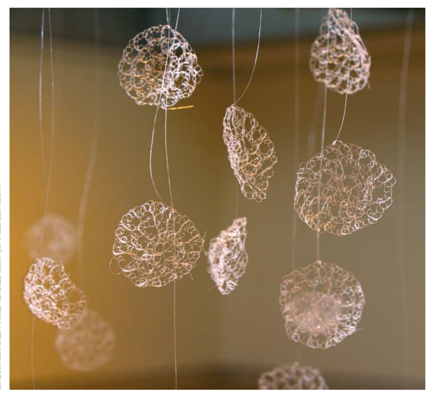
Sonia Donnellan, Breath in, Breath out (detail) , 2006, nylon thread, 800 x 800mm