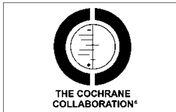
Fig. 2 The Cochrane Collaboration's logo incorporates a forest plot.

Systematic reviews appear at the top of the hierarchy of evidence. This reflects the fact that, when rigorously conducted, they should give us the best possible estimate of any true effect. However, caution must be exercised before accepting the findings of any systematic review without first appraising it. Like any piece of research, a systematic review may be done poorly. Not all systematic reviews are rigorous and unbiased. Little attention may have been paid to the intervention, the patient selection group or the search strategy; or the systematic review may have combined studies in meta-analysis which should not have been pooled because they differ in terms of intervention used or participants included. Therefore, it is important that users of systematic reviews become familiar with the steps involved