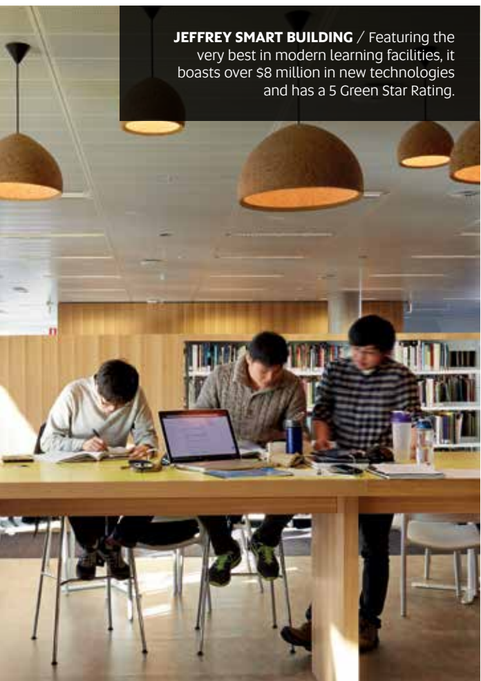
JEFFREY SMART BUILDING / Featuring the very best in modern learning facilities, it boasts over $8 million in new technologies and has a 5 Green Star Rating.