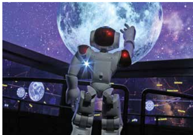
MOD. / This futuristic museum of discovery offers immersive experiences to the public through dynamic and changing exhibition programs across seven dedicated gallery spaces.

See this world-class project at unisa.edu.au/facilities/unisaCRI