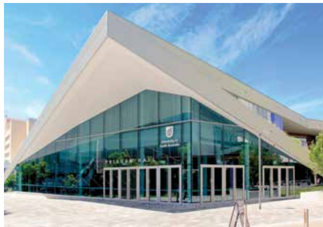
PRIDHAM HALL / A $50 million space that has transformed our campus blueprint in the city's west end; featuring a sports centre, lap pool, gym, dance/aerobics studio, function rooms, and facilities to seat 1800 students and their families for graduation ceremonies.

Discover the virtual fly-through at unisa.edu.au/pridhamhall