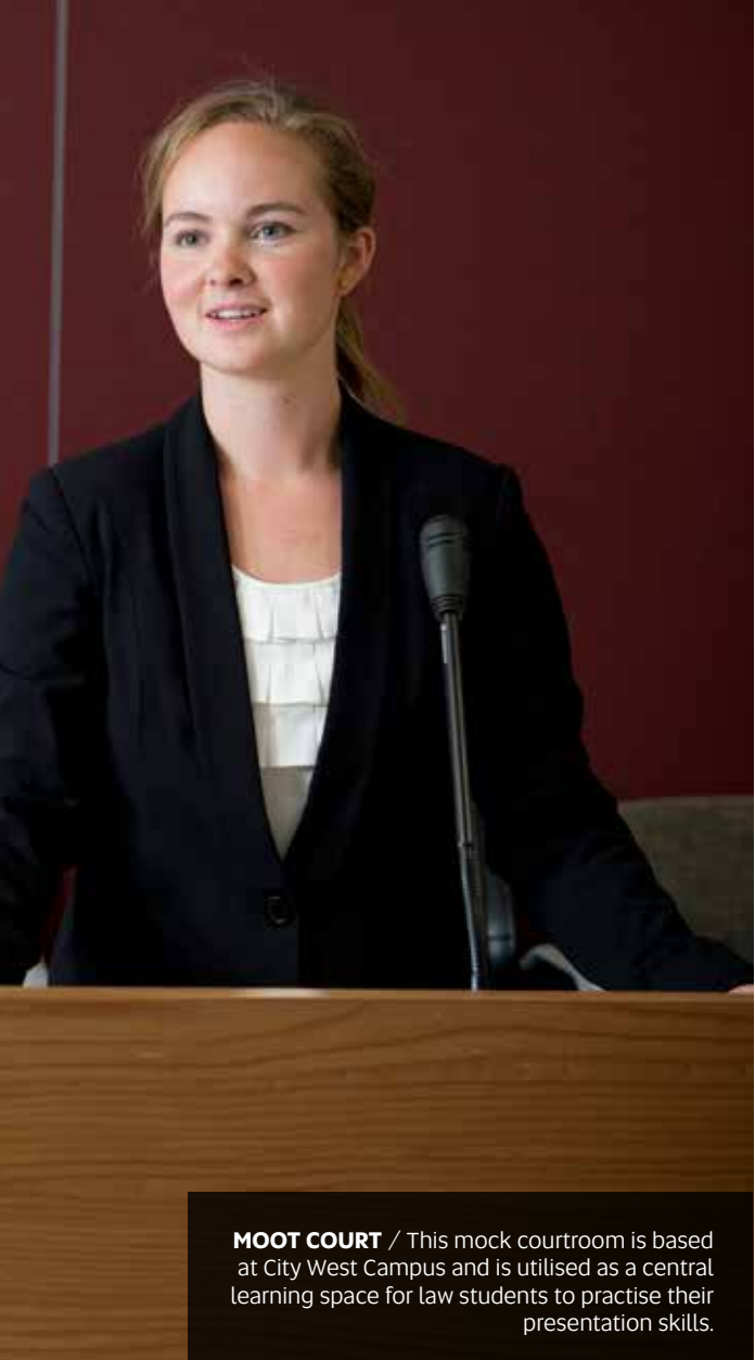
MOOT COURT / This mock courtroom is based at City West Campus and is utilised as a central learning space for law students to practise their presentation skills.