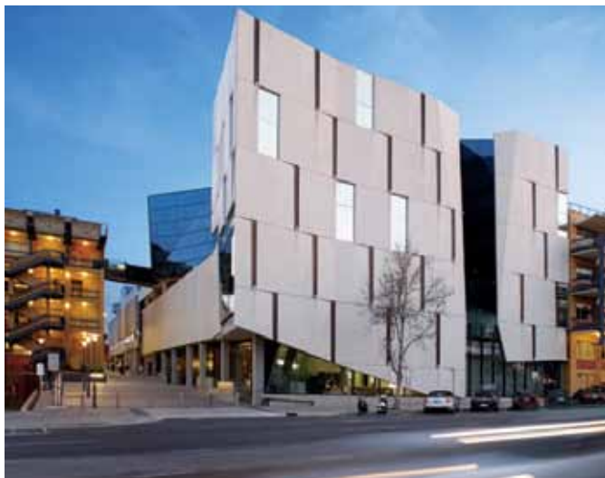
University of South Australia, Hawke Building