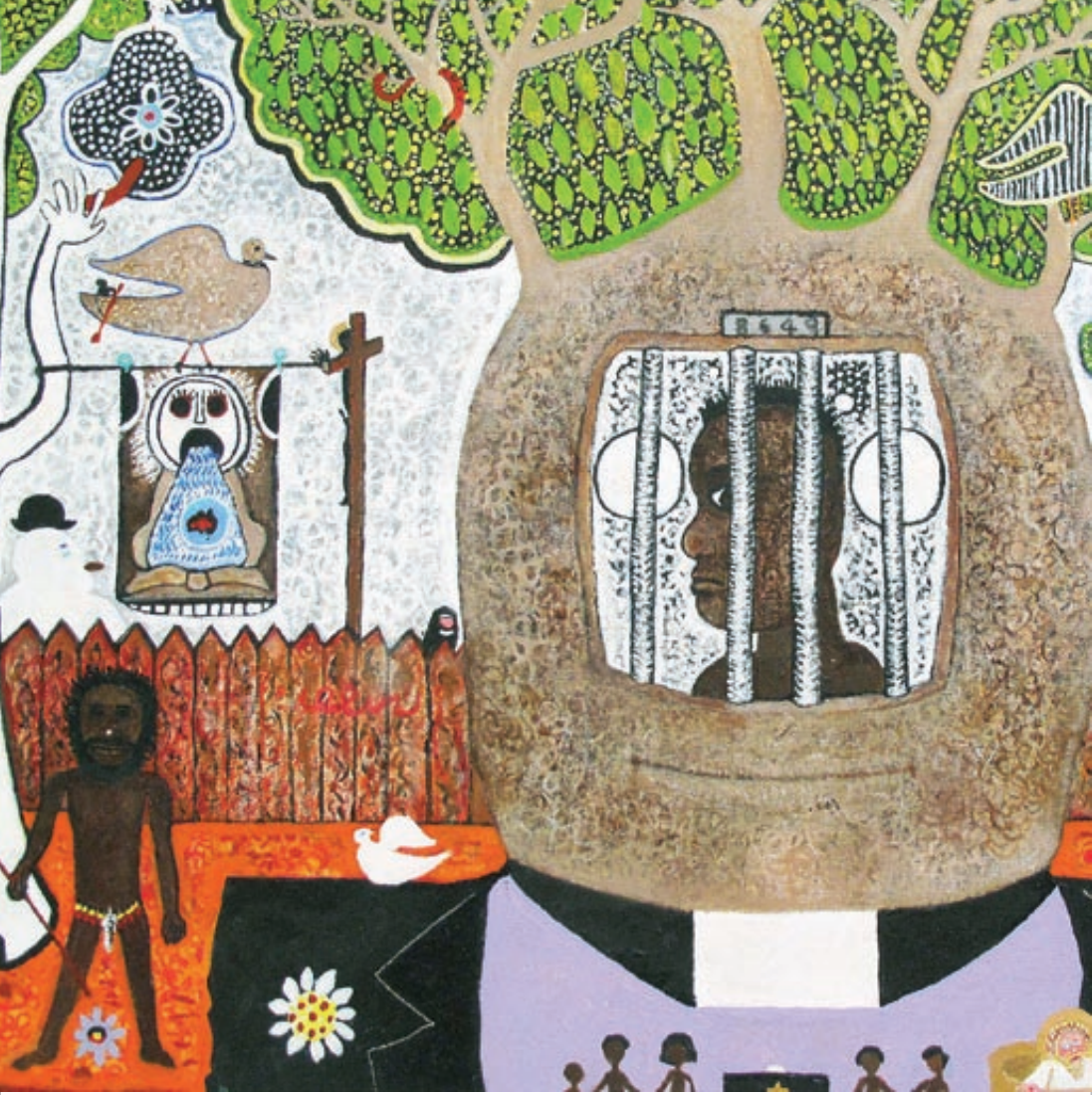
Trevor NICKOLLS, I fought the law (detail), 2009, synthetic polymer paint on canvas, 50 x 76 cm