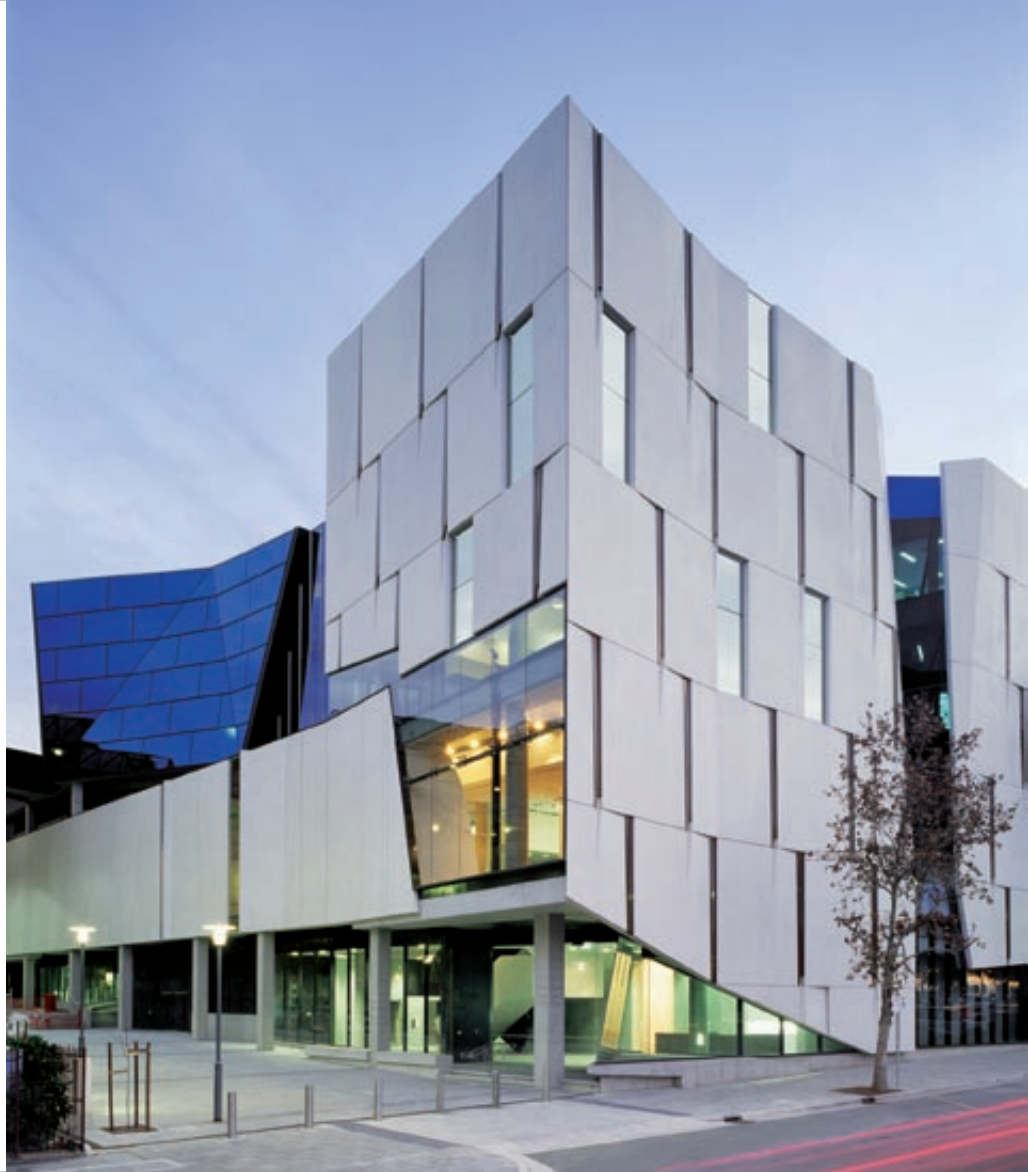
Hawke Building designed by John Wardle Architects + HASSELL