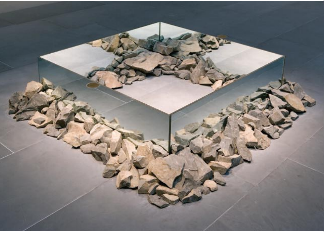
Robert SMITHSON, Rock and Mirror Square II , 1971 National Gallery of Australia, Canberra, © Robert Smithson/VAGA. Licensed by VISCOPY 2009