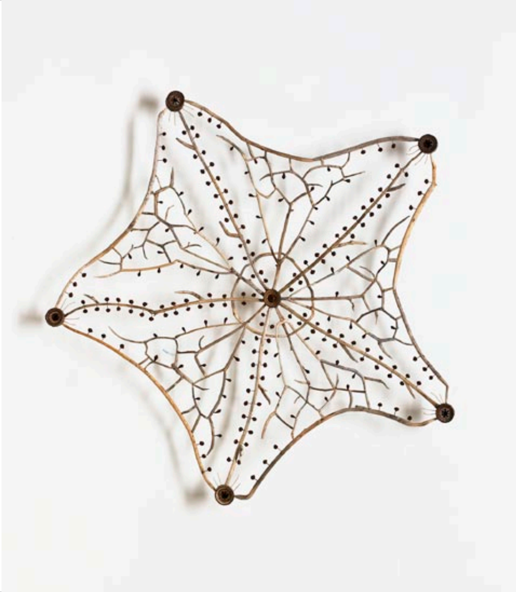
Shona WILSON, Diatom #8 , 2009, twigs, seeds, seedpods and plastic, 62 x 62 x 5 cm, © the artist